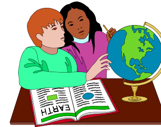
Parent/ Carer Booklet